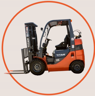
GAS/LPG DUAL FUEL